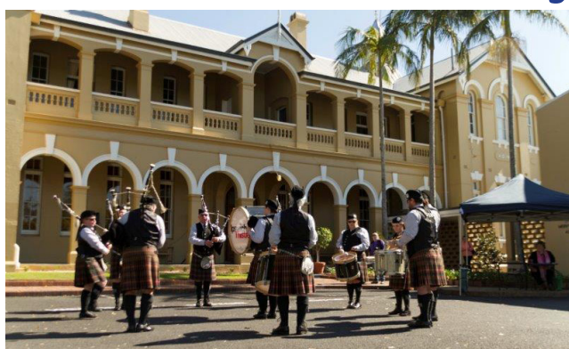
Faithful supporters – the Ipswich Thistle Pipe Band with our beautiful heritage building framed in the background