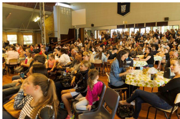
The Assembly Hall at lunch time packed with diners and audience all enjoying the feast of entertainment