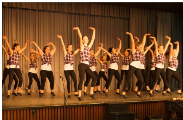
An IGGS Dance Troupe – one of the many groups who performed on the day

Our small OGA Fête Committee could fortunately build on the success of the previous years when the foundation was laid for the current format, though it had been decided that using only the grounds at the front of the School would have definite benefits. I had a few personal ambitions as well: to keep the area outside our heritage building clear so that as one staff member said, “our ‘old girl’ could be seen to advantage”; to increase the Old Girl participation; to involve the current girls more and to really utilise the Assembly Hall. As these pictures show these ambitions were fulfilled. (Continued P 2)