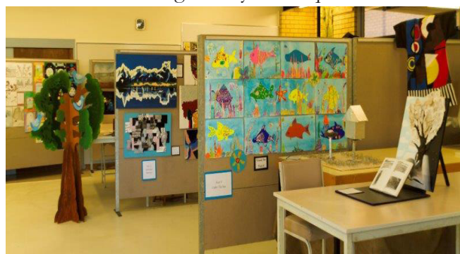
A section of the impressive display of student work