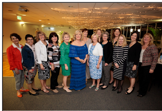
40 th Reunion