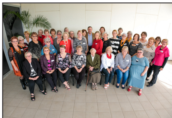
50 th Reunion