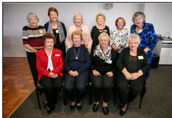
70 th Reunion